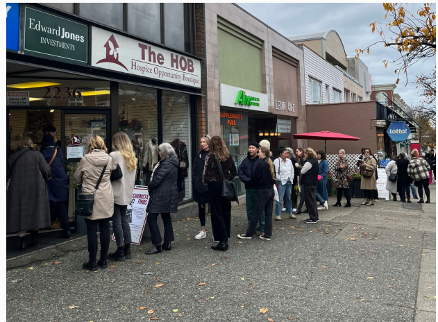
Pictured: The HOB storefront - Fashionista Finds event day had an amazing turnout.

In just three hours, our Fashionista Finds event at The HOB surpassed expectations, raising an impressive $12,220.00. With purchases occurring every two minutes, the community's enthusiastic support was evident. A big thank you to our consistent donors for making a significant impact on our shelves. Special recognition goes to the 'Fashion Police' and dedicated HOB volunteers for ensuring a seamless shopping experience. We express our deepest gratitude for the generosity and unwavering support.