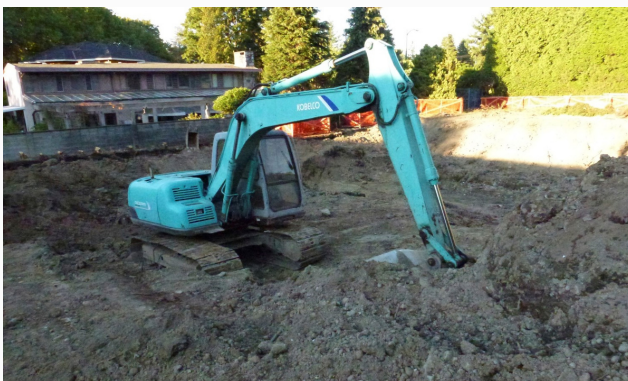
Pictured: Construction underway

The rancher-style home that gave way to our vision was demolished to create a blank canvas where careful planning came to life.