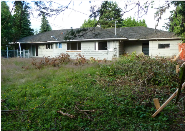
Pictured: Land acquired for Vancouver Hospice Society