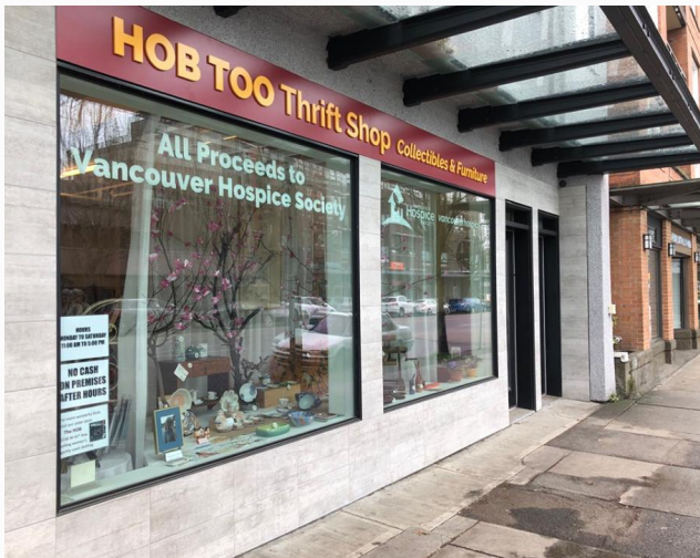
Pictured: HOB Too