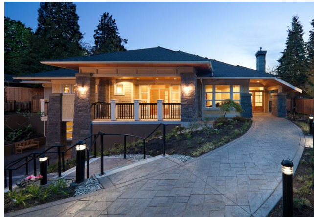
Pictured: Vancouver Hospice Society at dusk

Through extensive support and media attention, the dream materialized in 2014—more than just a building, it became a "home away from home" for our residents and their families. The hospice, a beautiful two-story building, began with six rooms that later expanded to eight rooms in 2017 when we partnered with Vancouver Coastal Health.