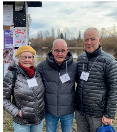
Pictured: Bereavement Walking Group Volunteers

We would also like to extend heartfelt gratitude to the Quilt Angels, whose beautiful, handcrafted quilts bring warmth and comfort to our patients.