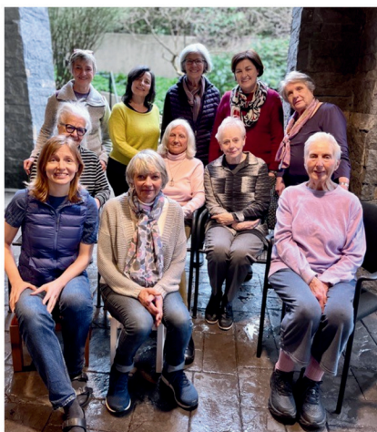
Pictured: Healing Touch volunteers

These numbers highlight the incredible dedication of our volunteers, who make an enormous impact on the lives of the patients, families, and community members we serve.