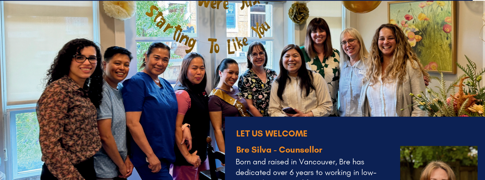
Pictured: VHS Clinical and Admin Teams

As we say goodbye to two valued members, we're also thrilled to welcome three new faces. Their unique talents and passion will help us continue providing compassionate care to our community. Here's to new beginnings and heartfelt farewells!