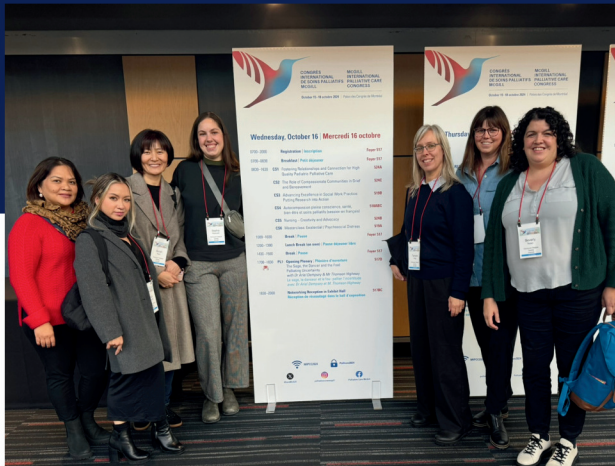
Pictured: Our palliative care and support team

"It was incredible to soak up the knowledge from palliative clinicians across the globe and see the innovative research and projects."